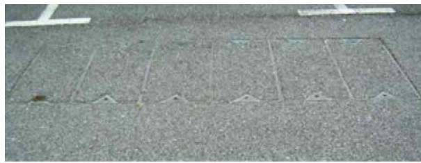
CW No.3 insert type