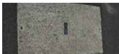
JF4 current type 55x100cm

Along with the twin, this is probably the most common footway type in the network. Originally the covers were made of cast iron and concrete but now they're just made of concrete.