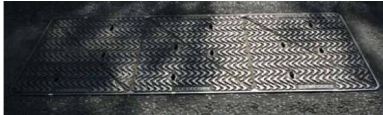
CW No.3 current type