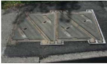
CW No.2 Silent Night 1220mm x 680mm