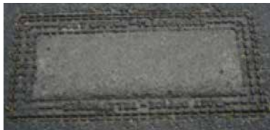
Old style cast iron and concrete 38x80cm

There is only one size of cover in this category. This lid can be found on a fibreglass preformed box, JB26, as well as a concrete/brick chamber, JF2. As with the JB 23 small footway box above the JB26 will have a thin white edge around the cover while the JF2 has a fillet.