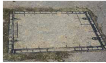
CW No.2 old type (Elkington)