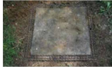
JF5 old type 70x70cm