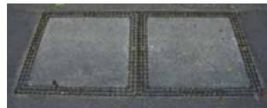
JF6 old cast and concrete type 70x140cm