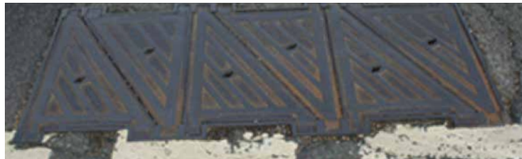
CW No.3 Silent Night type