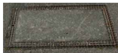
JF4 old type 55x100cm