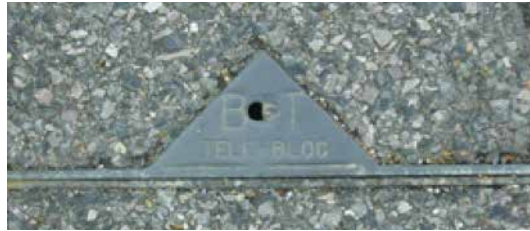
Detail of legend built into frame