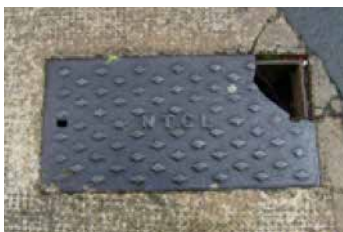
National Telephone Company Limited