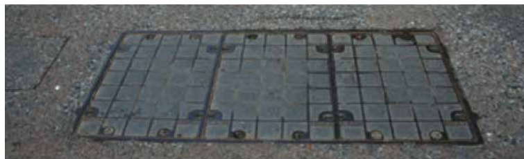
CW No.3 Elkington type